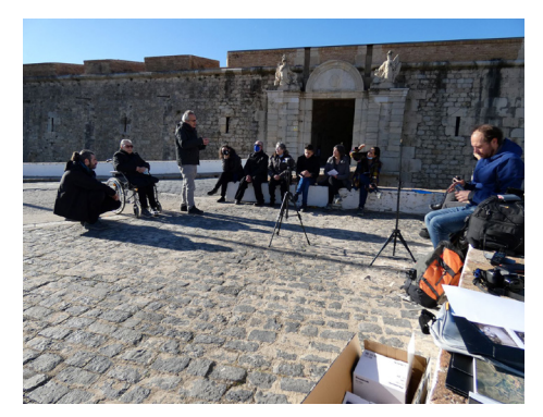
Past and present dialogue route, SO-CLOSE Project Archive

The second itinerary shows the view of the group -if we can call it that wayof people who have gone through this experience. This map deals with the route itself