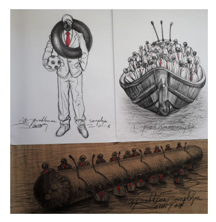
Series "To complex problems" by Javier Zamora, artist's private archive

your documents... life). I am also interested in freeing myself for a moment from the responsibility, even at a technical level, that the drawing has to be "well done". I am also very inspired by the inner self, a way into oneself. I practice a gesture that comes out and I don't want to stop it, it's always the same and it's always different. It always seems to be the same gesture, but sometimes it suggests things that are identifiable, like a head, or a skull for all the deaths in El Salvador. And right now, as I am outside those harsh realities, but I have others, that gesture has taken on a slightly more erotic connotation. With it, I separate myself a little from reality and I have a lot of fun.