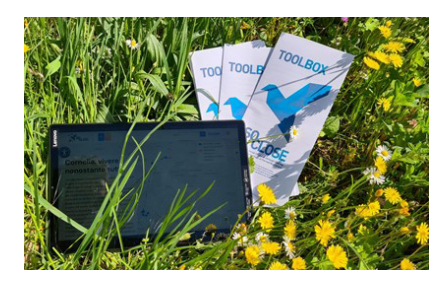
Testing SO-CLOSE Tools during the Open Day at Monte Sole

Every activity we offer starts with the group's presence in some of the places of the massacre, which activates cognitive and emotional processes that make the educational activity an all-around human experience. The idea of a path, of a journey, is something, then profoundly linked to the deep meaning of memory of the present and of the future elaborated by the Peace School. This is why the very first tool designed by the So-Close