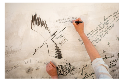
A piece of the mosaic created during the workshop with Group MOSAIC, Open Day in Villa Decius, Cracow 2022

Through her art, she wants to give people as much satisfaction, beauty, and inspiration as possible. She wants to make them smile - it's the best reward for me for all my work.