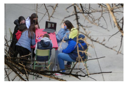
Workshop with social integration students and refugees

and the elements involved in it (causes, transports, borders, refugee camps, solidarity). In order to gather contents, we made a route through symbolic places of the republican exile with people who have had to leave their country of origin in the present time. In each place, the voice of witnesses of the past was brought to generate a dialogue between the current and the historical experiences.