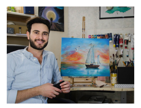
'The boat painting reminds me of the small boat that we used to get to Greece from Turkey, the boat that we trusted to carry our dream and our tired bodies can't be forgotten. '

Yes, we heard and saw that artists have historically used various tools to address the social issues of importance and provoke society, like war, injustice, racism, violence, and equality. Art can be such an effective tool; it has a great ability to focus the community on social problems. Art can help people connect with some aspect of social reality in a manner that they could otherwise have not without the aid of art.