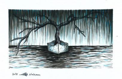
Nakam's work, 2019, artist's private archive

"If the activity is organised well it can have good affection on the society; it can be as a single artist or group of artist at the same time performing their idea about the same issue or installation in the public area or video art on the network".