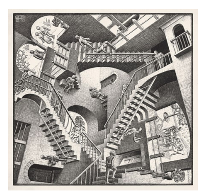
M.C. Escher - Relativity. Lithograph 27,7x29,3 cm. July 1953, www.mcescher.com

The choice for the second tool to use was the result of the long and multilayered participative process the So Close designed for the first part of the project. Through interviews, focus groups and workshops, the harsh past of the Italian fascist dictatorship WWII and its tragedies were shared and put in the context of the situation of the newcomers who chose to participate in the project. Some of them directly experienced the violence of war, some others suffered from prosecution and discrimination, and some have in their memories the link to a European colonial past that is deploying the consequences till today, both in the home country and in the family and personal memories. It was quite clear for anyone participating that those discussions were pivoting around some key words and concepts and that those words and concepts needed to be shared around if the goal was to reinforce and promote social cohesion. Among the tools, there was the perfect way for this sharing: the participatory VIRTUAL EXHIBITION. The idea was to exploit each concept as a matter of inspiration and – as curators do – to aggregate different pieces (pictures, music, paintings, videos) capable of rfepresenting the initial idea of the creators' group and stimulating new perspectives, connections and ideas in the users.