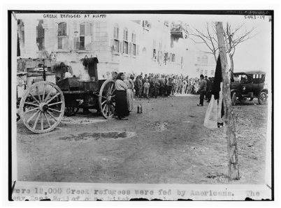
"Syrian Refugees" 1943. Picture from the GFR web doc. Source description in references.

C Using the web doc and virtual exhibition not only can compare similar refugee cases from the past to the present. But these platforms are also a perfect way to showcase the accomplishments and skills of Refugees. A lot of refugees have difficulty justifying their capabilities, skills, and qualifications as they have lost their papers on the journey to Europe.