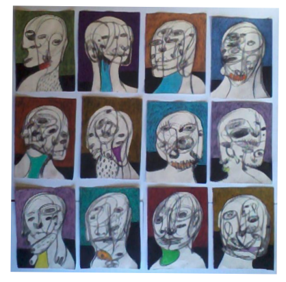
Twelve pieces of paper from the series "I just know it's me" by Javier Zamora, artist's private archive

repressed or not, it's something you carry inside. We are humans.