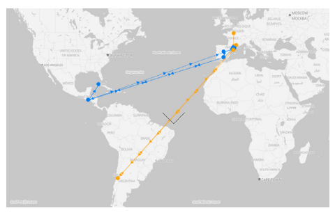
A glimpse of MUME's Storymap SO-CLOSE Project Archive

The first itinerary focuses, above all, on the beginning of the journey: on the emotions, the decisions, the comings and goings. This is done from the point of view of the individual, specifically, of an artist exiled for the Spanish civil war and of an artist exiled nowadays. Artists and their relatives have provided us with the content and images to complete their routes.