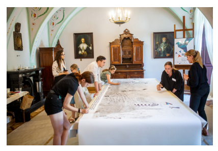
SO-CLOSE project workshop with MOSAIC Group, Villa Decius 2022

Nina says that a contemporary artist can be the initiator, the originator of a project, or an activity." Through activities, social actions, art can engage, unite and get to know people living close to each other every day". She herself supports local communities and integration practices through conducting public workshops. "I try to show people from the local community that art is not to be feared, and everyone can face it on the basis of fun, experience", she says.