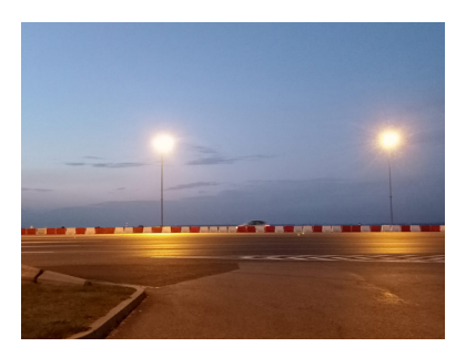
"Transit" from the exhibition "Unpromised Land - where the past is present in the space"

A historian with experience in archive-based research was employed to gather the stories. It turned out, however, that the narrative created by her was not very interesting as it only dealt with some facts and provided some references to the own experiences of the refugees. The results had to be enriched by the photos, so we searched in family archives as well as in museums we had contacted. The challenge was to transform very informative results of the archive-based research into more reader-friendly, human-based stories. We also searched in very close proximity of family members.