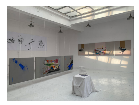
Nina Dziwoki's thesis art pieces, artist's private archive

people, from the smallest things and places, shows order and harmony, and wants the viewer to feel something when approaching her painting. Her monotypes carry affirmations, especially of the female body, showing scars, imprints, scratches and imperfections as something special.